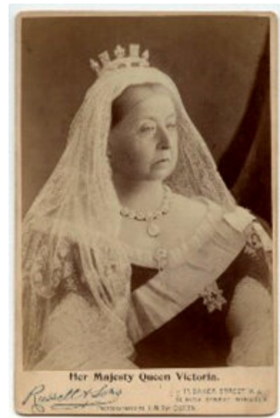
Russell & Sons photographs of: Bishop of Exeter 1886; Prince of Wales and family 1884; Queen Victoria 1890s

Although in the first two examples I was able to obtain the date within a year or two I could not name the sitter – neither did I expect to. However when I'd finished researching the card on the right I had a lot more than the man's name! It didn't look promising when I found that the photographer was based in Quincy and there are 17 towns called Quincy in the United States.